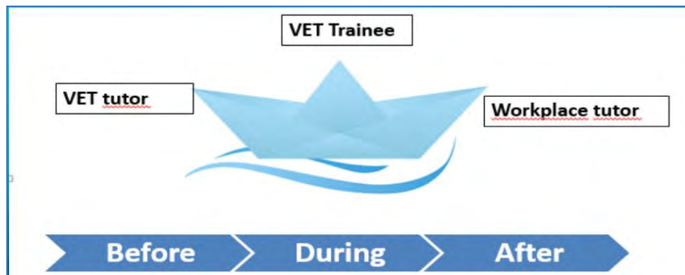
Image 3. WBL process

Training is implemented as a simulation of WBL process Before-During-After looking from the perspective of 3 main actors: VET tutor, Trainee, Workplace Tutor (See Image 3 ).